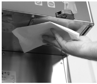
2. Use a clean damp cloth rinsed in mild, non-abrasive detergent to clean both sides of the sprayhead panel.