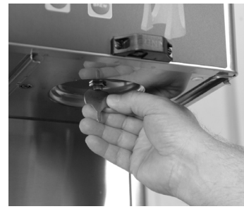
4. Insert the long end of sprayhead cleaning tool into the sprayhead fittings, and rotate several times to remove any mineral deposits from the fitting.