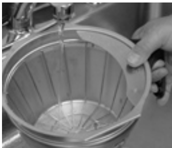
1. Clean and sanitize funnels.