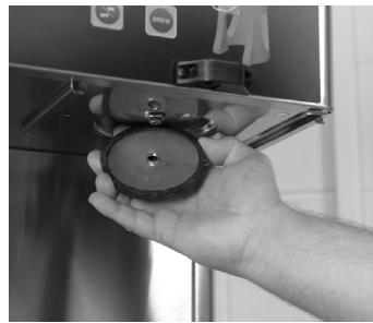
3. Remove sprayheads from brewer. Disassemble by removing the seal.