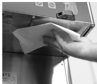
7. The use of a damp cloth rinsed in any mild, nonabrasive, liquid detergent is recommended for cleaning all surfaces on Bunn-O-Matic equipment. Do NOT clean this equipment with a water jet device.

See installation and operating manual for calibration routine to verify sprayhead flow rate matches programmed flow rate. Machine may need to be re-calibrated due to lime build up or the use of alternate designed sprayheads. If machine is cleaned and build up removed, machine must be re-calibrated to achieve desired volumes.