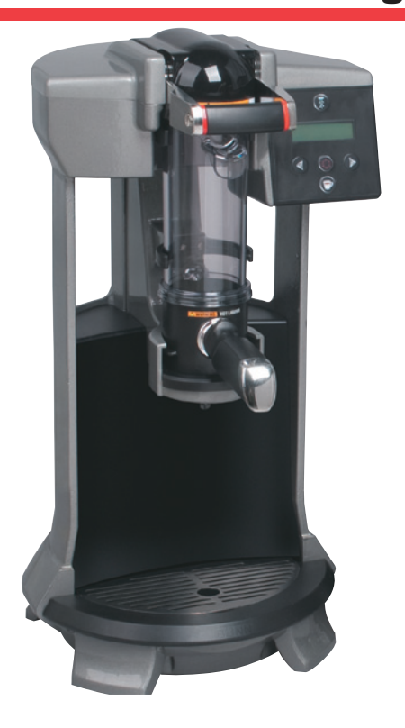
trifecta Dimensions: 26.73"H x 11.89"W x 11.87"D (60.3cm H x 30.2cm W x 30.1cm D)